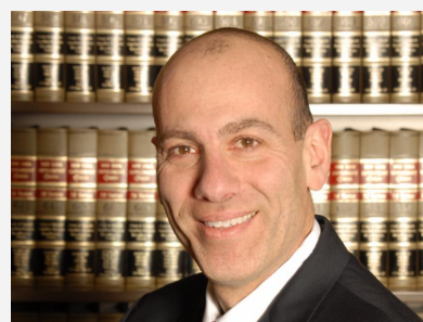
James G. Dibbini & Associates, P.C.